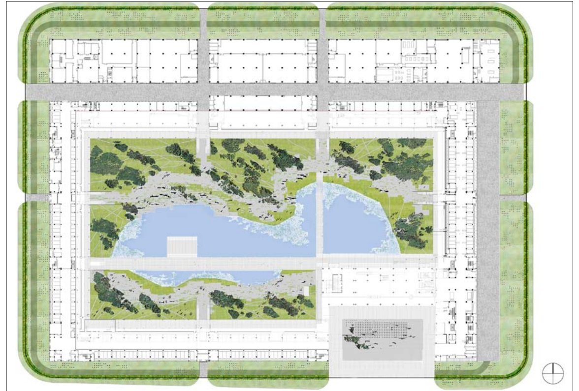
1 - n° 12211 - master plan